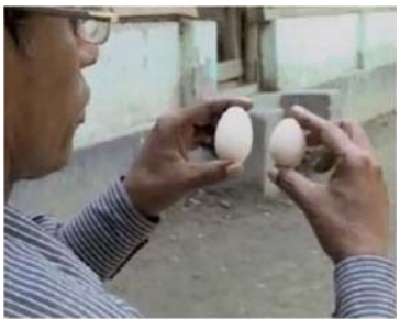
Selecting eggs for incubation

Step 2: A gunny bag followed by a black coloured cotton cloth is spread over the first three trays on which the eggs for hatching are to be placed. A disinfectant like Dettol or Savlon is also sprayed inside the incubation box prior to placing the hatching eggs.