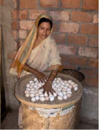
A poultry rearer heating the eggs on a bamboo strainer prior to putting them in the incubation cylinders

Step 2: The incubation box is filled with rice husk, 6 inches deep and covered with jute sheets. An incubation box with the aforesaid dimensions can house two