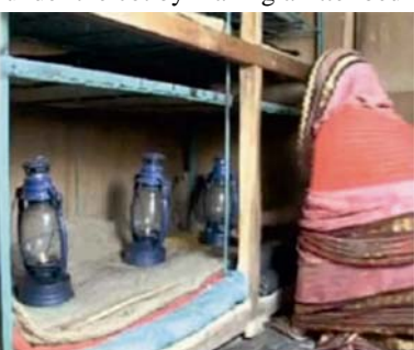
Poultry rearer adjusting the flame of the hurricane lamps to control temperature inside the incubator

Step 5: Meanwhile the kerosene lamps are placed inside the incubating box so that the sand gets heated up to a temperature of 98-100°F or 36.5-37.5°C. Generally the lamps are placed 3-4 hours prior to placing the pre-heated eggs in the incubating box. A bowl full of water should be kept next to the kerosene lamps and be re-filled constantly to avoid loss of complete moisture and maintain the required humidity of 70-80%.