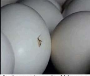
Cracks appearing on the chicken eggs

Step11: 20<sup>th</sup>-21<sup>st</sup> day: Chicks can be observed coming out from the eggs. They should not be touched until they are completely dry. The chicks normally dry within 40-45 minutes after hatching and should then be removed to a separate basket.