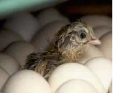
Chicks hatching out of eggs

duck eggs, sponging should be done only after the 24th day.